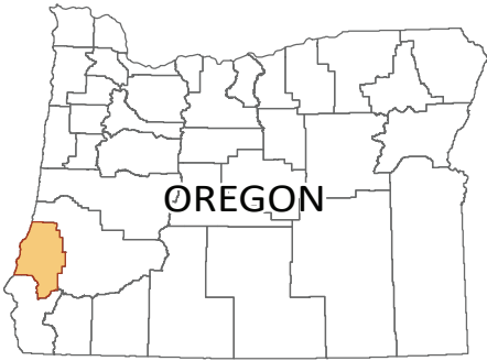
Study Location Map

Data Sources: Flood hazard zone (100-year): Coos County Flood Insurance Rate Map (2018) Roads: Oregon Department of Transportation (2014) Place names: U.S. Geological Survey Geographic Names Information System (2015) City limits: Oregon Department of Transportation (2014) Basemap: U.S. Geological Survey and Oregon Lidar Consortium (2012) Hydrography: U.S. Geological Survey National Hydrography Dataset (2017) Projection: NAD 1983 UTM Zone 10N Software: Esri® ArcMap 10, Adobe® Illustrator CS6 Cartography by: Lowell H. Anthony, 2018